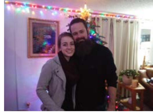
The oldest and youngest Haynes siblings.