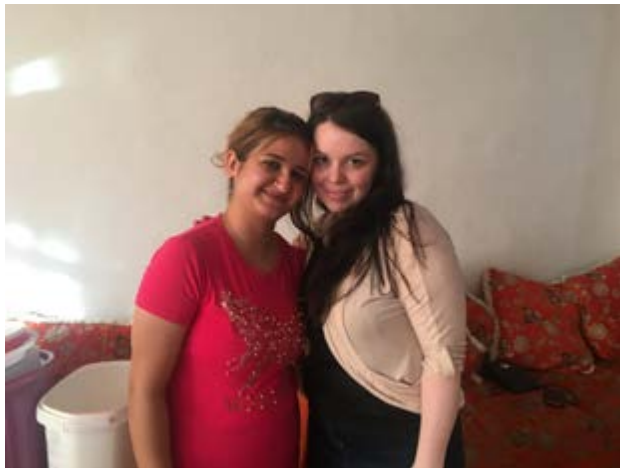
Our Yezidi neighbor who has since moved back home.