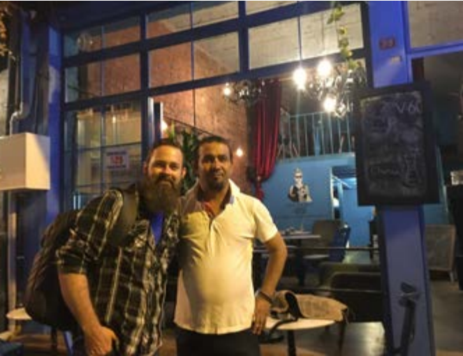
Kurdish man from Turkey who understood our dialect of Kurdish!