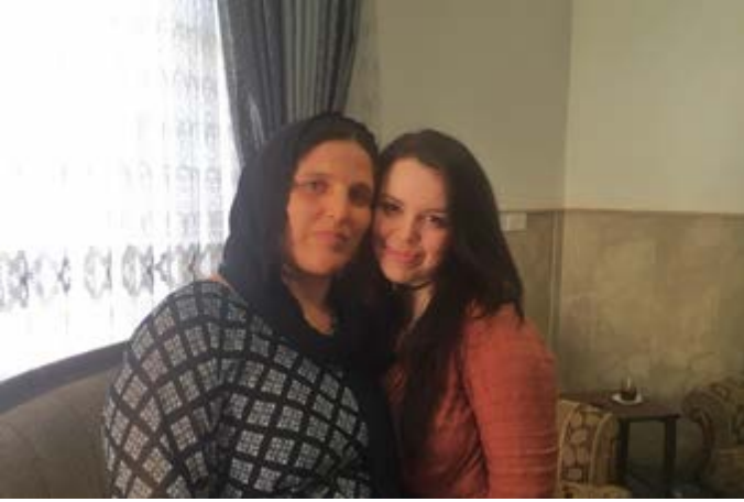
The mother of one of our language teachers.