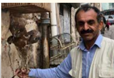
Who knows what you will find for sale in Kurdistan!