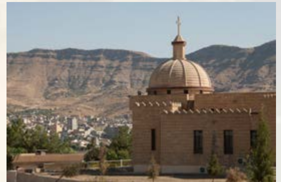
Assyrian Catholic Church. Wherein is found no truth and no hope.