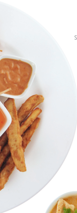
TOM YUM SOUP

Selections of our five favorite appetizers: coconut shrimps, chicken satay, crazy crab puffs, Thai veggie rolls and sweet potato