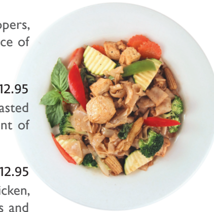
PAD KEE MOW Flat wide rice noodles with Thai basil leaves, garlic, vegetables and your choice of meat