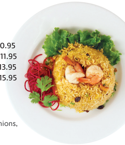
PINEAPPLE FRIED RICE with shrimp, chicken, raisins, and cashew nut