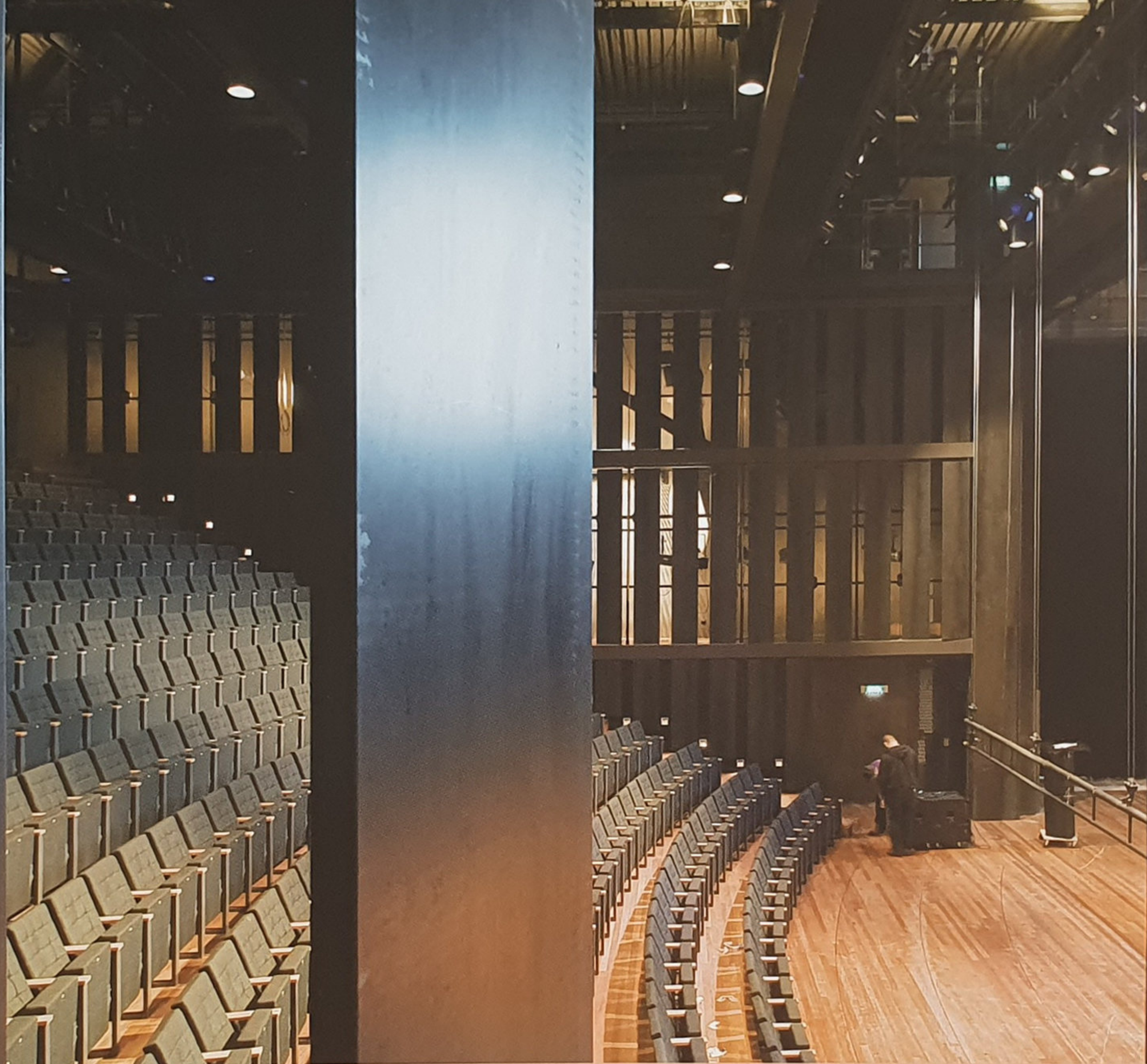
From left to right, from above to below: Public space around the auditorium, foyer, auditorium with on both sides the technical galleries, luminous bench under the auditorium. Right: Auditorium seen through the louvres of the technical gallerie.