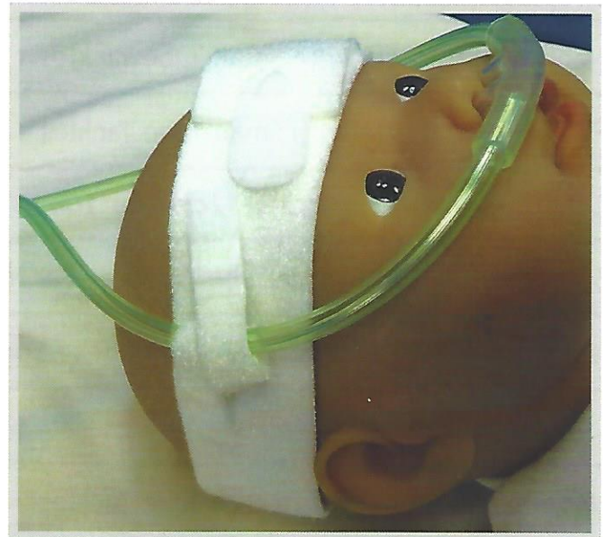
Neonatal Strapette with Small Tube Tackles