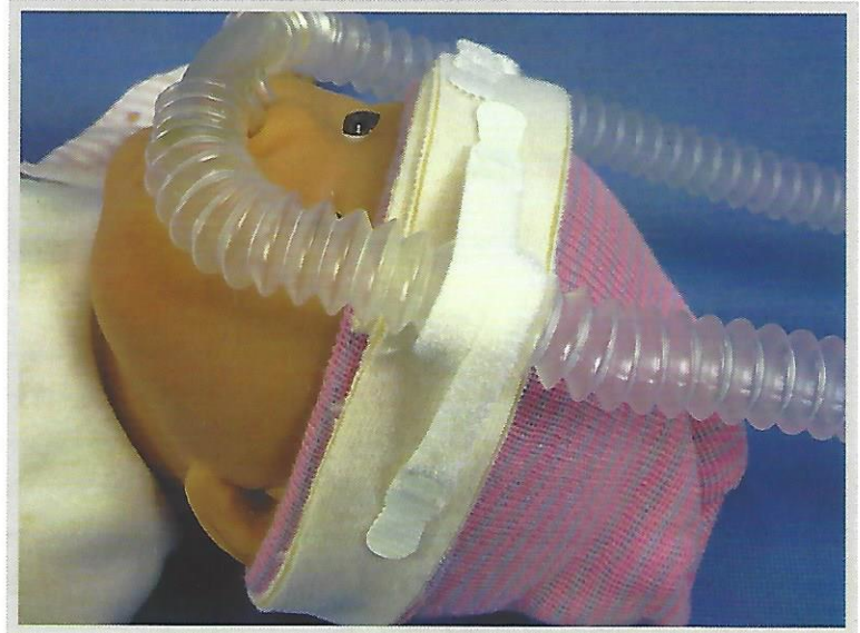
Large Capette with Large Tube Tackles