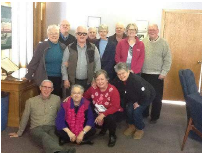
The Group meets for Friday Morning coffee at 10.00 a.m.