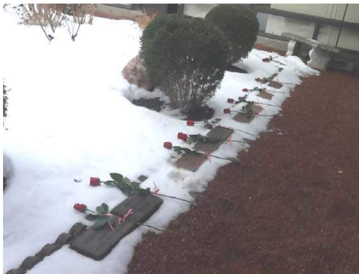
Roses laid on the Memorial Stones in our garden