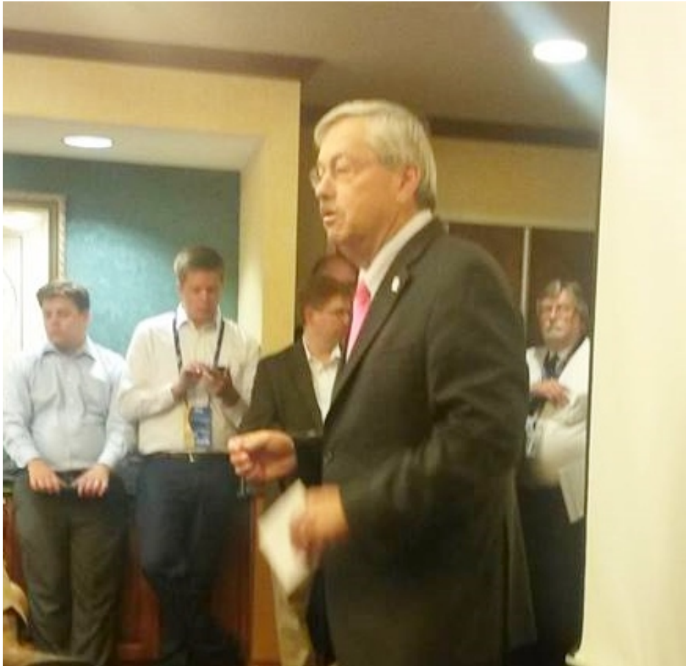
Gov. Branstad addresses the Iowa delegation sharing a bit of history from campaigns of the past.