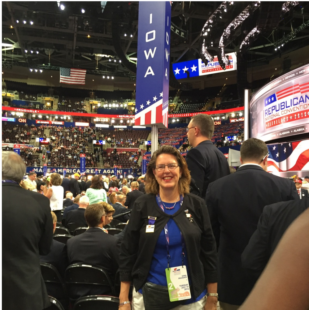
On the convention floor with the Iowa delegation.