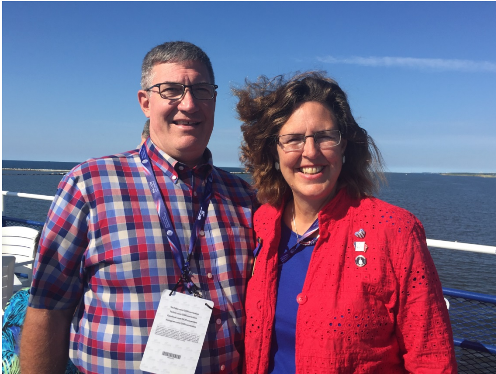
The Iowa delegation enjoyed a boat ride on Lake Erie during an afternoon during the convention.