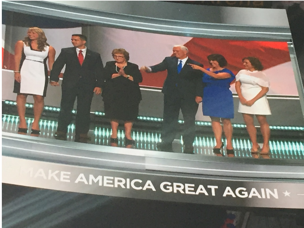
Indiana Governor Mike Pence with his family when he is nominated as the Vice-President.