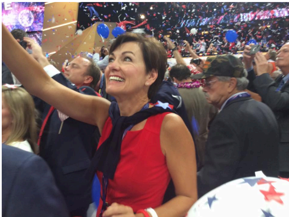
Lt. Gov. Reynolds cheers during the convention festivities.