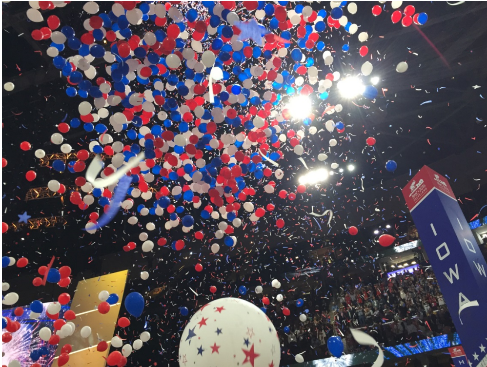
Balloons dropping down on the convention arena!

My phone is 319-987-3021 or you can email me at sandy.salmon@legis.iowa.gov . I want to hear what you are thinking and will listen to your input. Together we will work to make a difference for the future of Iowa. Thank you very much for the honor of representing you!