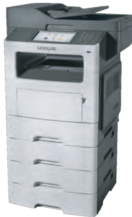
Lexmark XC6152 Series Color laser MFP