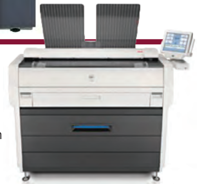
KIP 7170 MULTIFUNCTION

Hagan Business Machines Of Meadville, Inc.