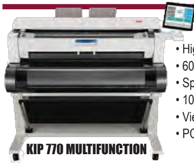
KIP 770 MULTIFUNCTION