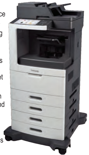
Lexmark XC2132 Color Laser MFP