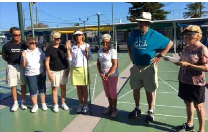
New Shuffle Club officers were sworn in.