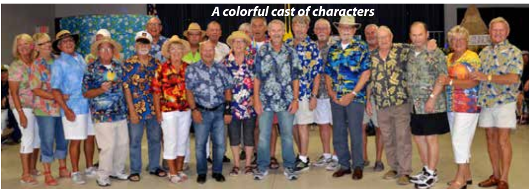
A colorful cast of characters