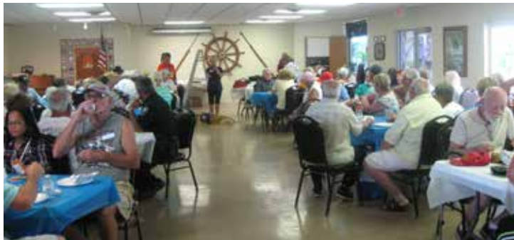
120 people enjoyed the first "Hot Dog Thank You Party" in appreciation for all donations given to the Southeast Guide Dogs.