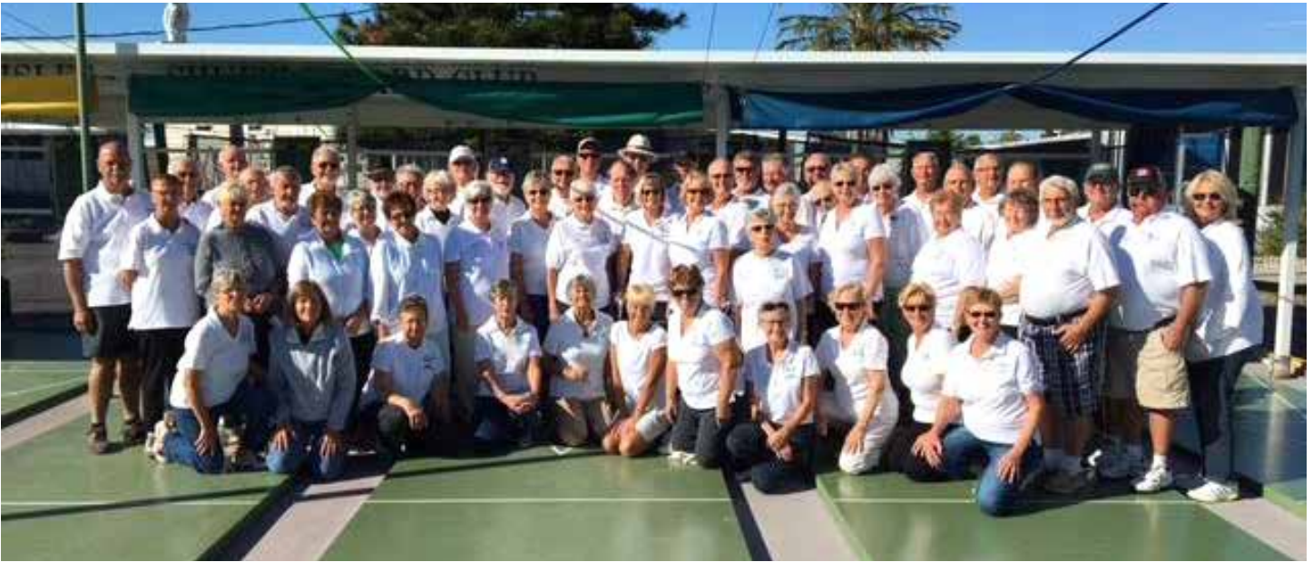
2018 Shuffleboard Club members