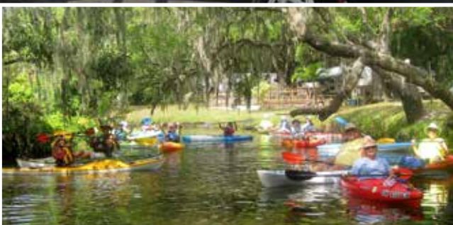
Paddling on the Braden River to Linger Lodge.