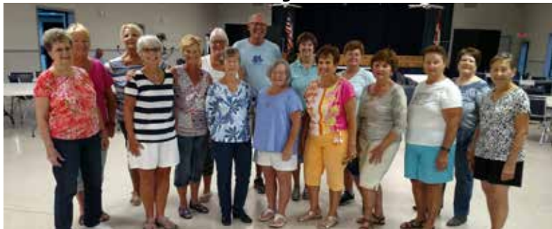
Farewell to line dancing for the season.