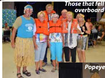
Those that fell overboard