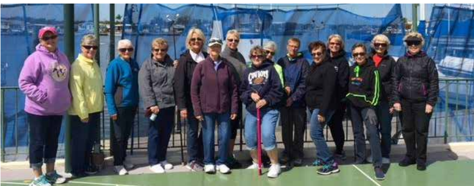
Men vs Women Shuffle Tournament is held every year.