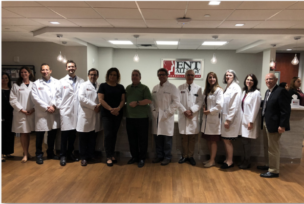
ENT and Allergy Associates, LLP