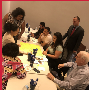
Workshops and Seminars