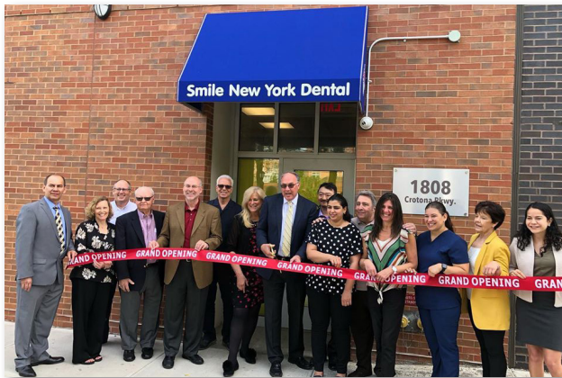
Smile NY Dental