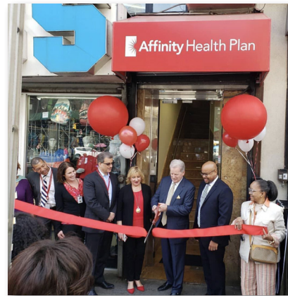
Affinity Health Plan