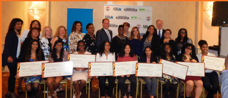
Women of Distinction