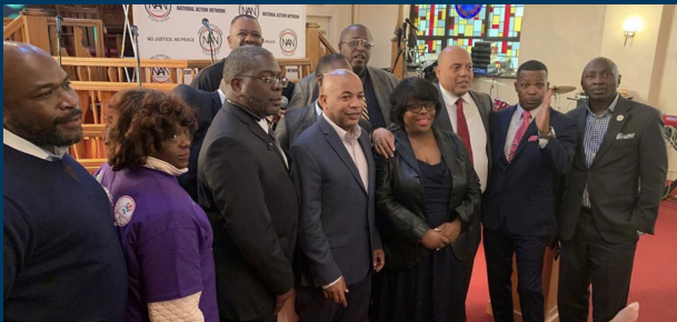
Meetings with Elected Officials