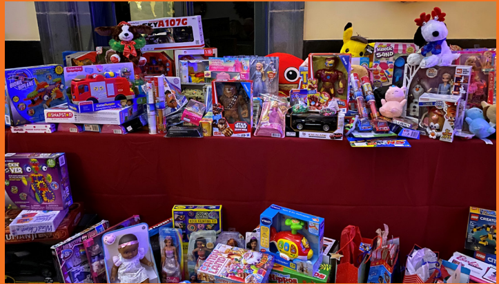
Holiday Party & Toy Drive