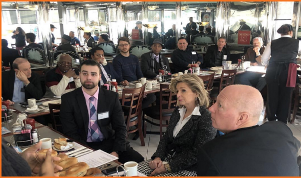
B2B Networking Events