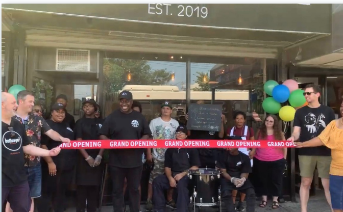
Soul Snacks Cafe