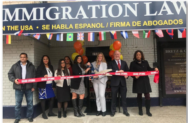
Bretz & Cove Law Firm