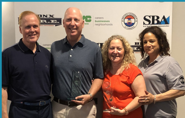
Annual Golf Outing