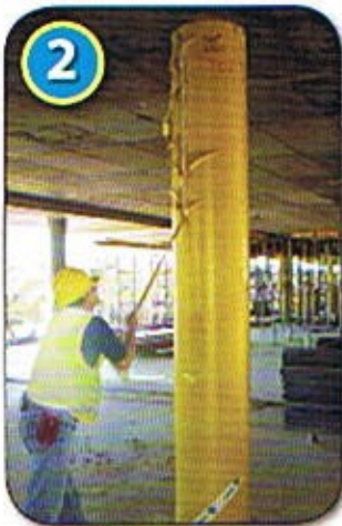
2 Pull evenly on "EzyStrip Tape"