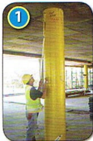
1 Detach base of "EzyStrip Tape" from tube