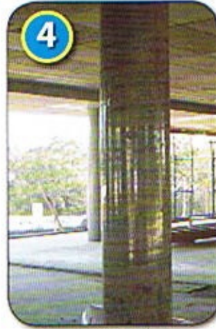
4 Finished! Removed in minutes

Square & Rectangular columns. Faster and lighter than any competitive method