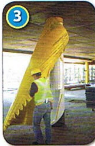
3 Remove tube from the column