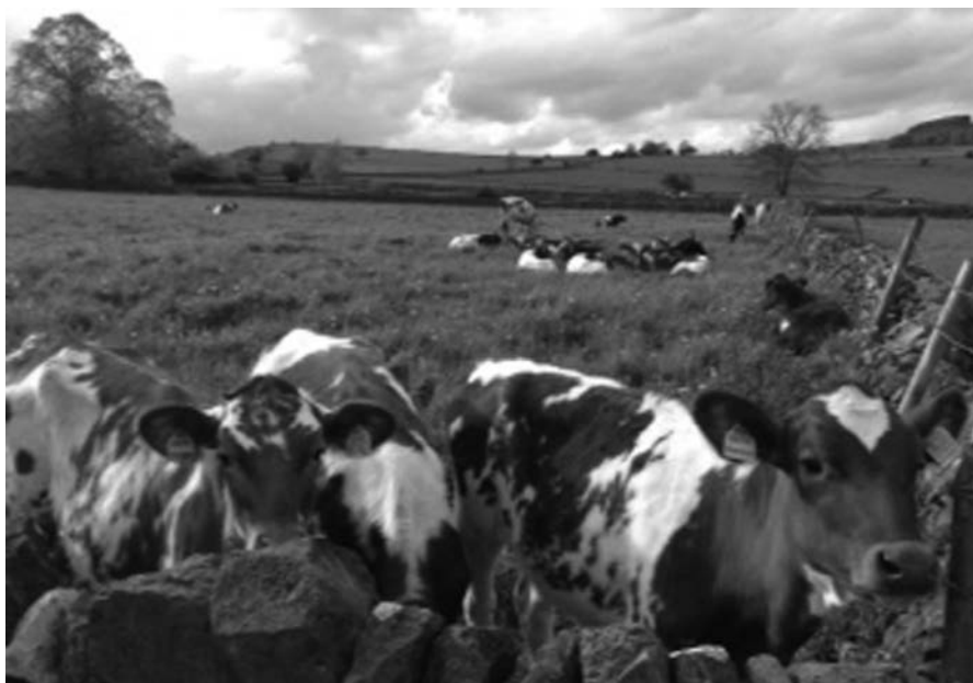
Sink hole survivors

firemen who set about digging steps out of the six feet deep hole. This enabled the heifers to scramble out, hungry and thirsty but none the worse for their ordeal. The animals were moved to the next field so that the hole could be filled and now you would never know where the ground