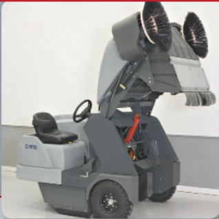
The SR 1900 incorporates superb high-dump capability up to 152 cm from ground level.