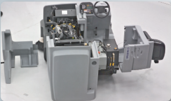
Exceptionally easy serviceability is achieved with Nilfisk's NoTools™ system. The 5-sided access to engine and hydraulic components saves time and keep down the service cost.