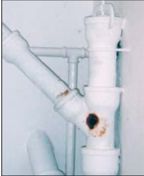
Rust is an indicator that condensation occurs on this drainpipe. The pipe should be insulated to prevent condensation.

Renters: Report all plumbing leaks and moisture problems immediately to your building owner, manager, or superintendent. In cases where persistent water problems are not addressed, you may want to contact local, state, or federal health or housing authorities.