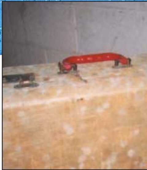
Mold growing on a suitcase stored in a humid basement.

It is important to take precautions to LIMIT YOUR EXPOSURE to mold and mold spores.