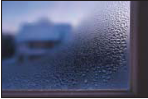
Condensation on the inside of a windowpane.

■ Keep indoor humidity low. If possible, keep indoor humidity below 60 percent (ideally between 30 and 50 percent) relative humidity. Relative humidity can be measured with a moisture or humidity meter, a small, inexpensive ($10-$50) instrument available at many hardware stores.