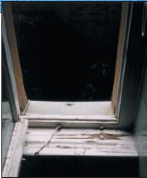
Leaky window – mold is beginning to rot the wooden frame and windowsill.

If you already have a mold problem – ACT QUICKLY. Mold damages what it grows on. The longer it grows, the more damage it can cause.