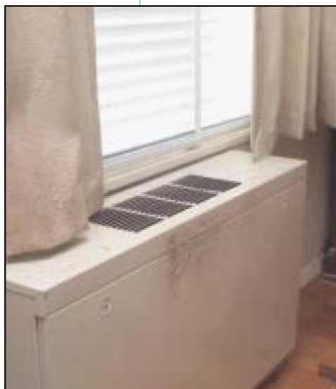
Mold growing on the surface of a unit ventilator.