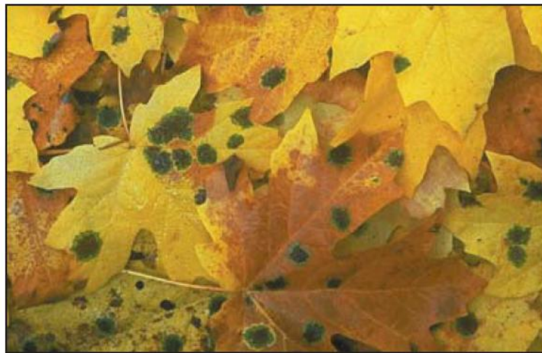
Mold growing on fallen leaves.

This document is available on the Environmental Protection Agency, Indoor Environments Division website at: www.epa.gov/iaq/molds/moldguide.html