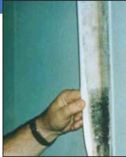
Mold growing on the back side of wallpaper.

Suspicion of hidden mold You may suspect hidden mold if a building smells moldy, but you cannot see the source, or if you know there has been water damage and residents are reporting health problems. Mold may be hidden in places such as the back side of dry wall, wallpaper, or paneling, the top side of ceiling tiles, the underside of carpets and pads, etc. Other possible locations of hidden mold include areas inside walls around pipes (with leaking or condensing pipes), the surface of walls behind furniture (where condensation forms), inside ductwork, and in roof materials above ceiling tiles (due to roof leaks or insufficient insulation).