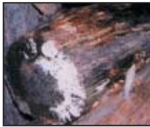
Mold growing outdoors on firewood. Molds come in many colors; both white and black molds are shown here.

Molds are part of the natural environment. Outdoors, molds play a part in nature by breaking down dead organic matter such as fallen leaves and dead trees, but indoors, mold growth should be avoided. Molds reproduce by means of tiny spores; the spores are invisible to the naked eye and float through outdoor and indoor air. Mold may begin growing indoors when mold spores land on surfaces that are wet. There are many types of mold, and none of them will grow without water or moisture.