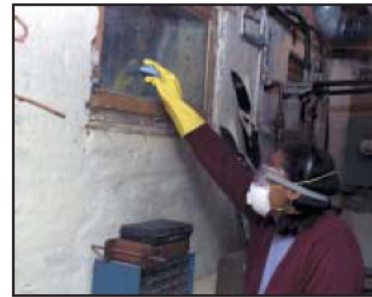
Cleaning while wearing N-95 respirator, gloves, and goggles.