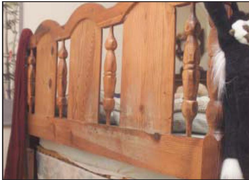
Mold growing on a wooden headboard in a room with high humidity.