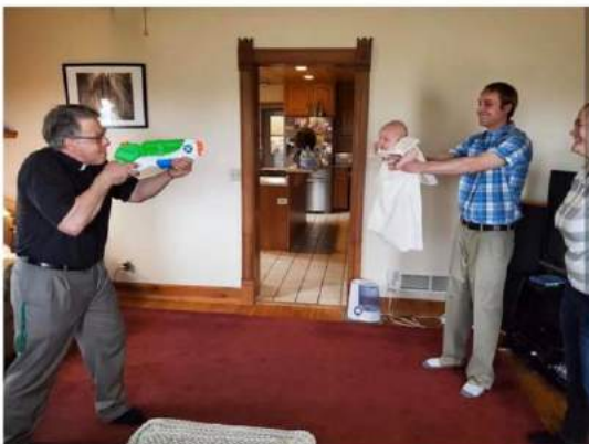
Social distancing baptism