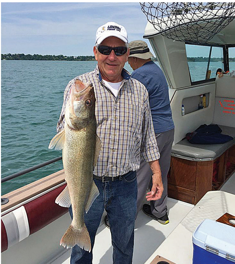
A slow countdown technique produced this trophy walleye.

Las Vegas on my way to the AFTMA tackle trade convention. Sitting across the isle from me was an older gentleman dressed in sailor whites. He nodded, I nodded and he asked if I was going to the convention. A few minutes later he was sitting in the vacant seat beside me. I mentioned I was impressed with his baits. Over a few beers for me and a mixed concoction for the Captain he began filling me in on his history and his company.