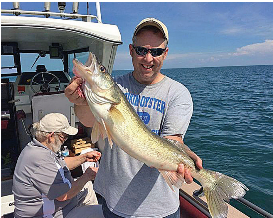
Pelee Island located in the Ontario western basin of Lake Erie is home to some of the world's finest walleye fishing.