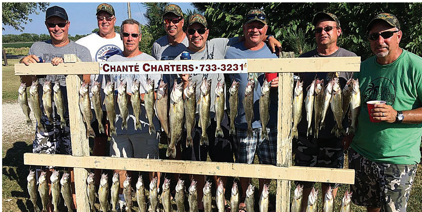
The results of just a few hours of Erie Dearie countdown fishing.

Experts estimate that the present Erie walleye population is at between 116 to 125 million fish swimming in lake. Once again making it is the world's best walleye fishery.