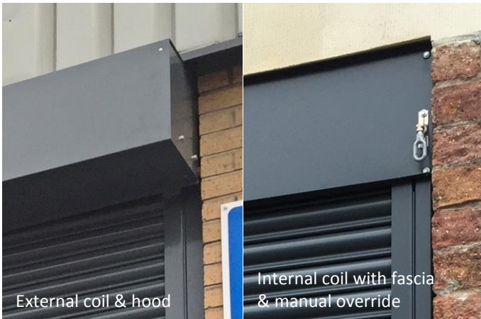
External coil & hood