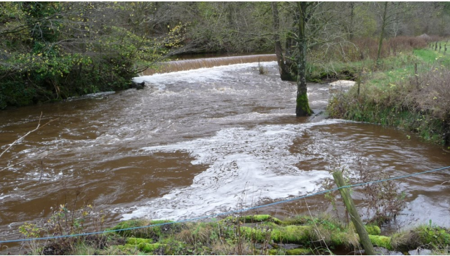
Bobbin Mill Weir Cressbrook and Litton water

As you can see fishing would have been out of the question and in places dangerous. Because of the number of people who wanted to fish, I booked four of my own guest tickets on the Cressbrook and Litton Fly Fishers grayling section of the River Wye. This too was in flood and very coloured.