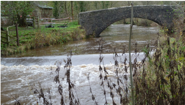
The gauging weir below the Bobbin mill bridge Cressbrook and Litton water.

Disappointed, but not down hearted that I had to cancel, I managed to rearrange the day on the Sunday 29th November. Once again, the clubs were willing to allow us to use their waters and the Bridge Inn could accommodate us for the usual drinks in the morning and buffet in the evening.