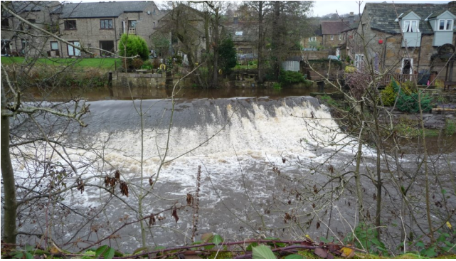
Baslow Weir (Near the bottom of the Police water)

As you can see fishing would have been out of the question and in places dangerous. Because of the number of people who wanted to fish, I booked four of my own guest tickets on the Cressbrook and Litton Fly Fishers grayling section of the River Wye. This too was in flood and very coloured.