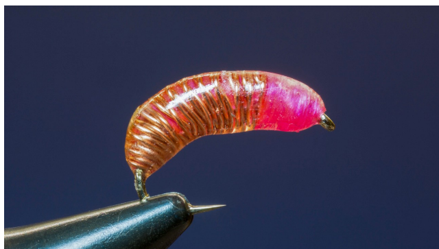
Epoxy Twisted Wire Bug