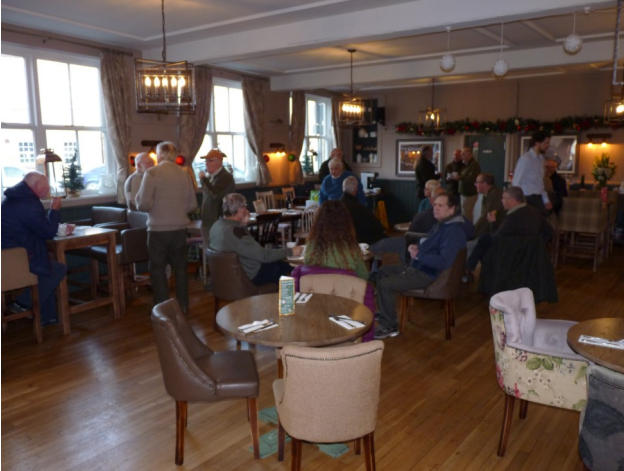
The morning gathering