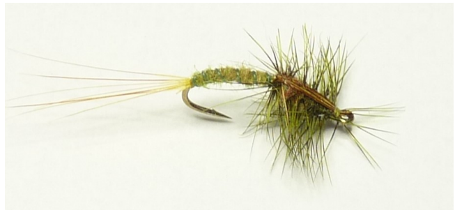
The underside (Tied this way up)