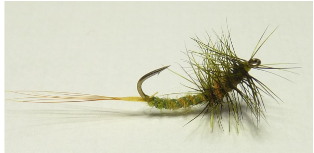
This way up when landed.

This is another of the flies that I have experimented with and have had some success particularly on the Derwent It worked particularly well during the evening rise around May /June.