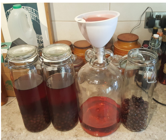
Starting off filtering

I started Filtering the 4 “bad boys” today. The gin had been on the sloes for 3 months and had produced a beautiful ruby colour. After using 8 filter papers to clarify the brew I finished up with 4 litres of young fruity sloe gin. When visiting my local “Home Brew” shop I noticed this “Kilner” container with a tap. This I thought after another few months of maturing the sloe gin the container would be perfect for filling the odd glass or bottle as any sediment would have settled below the tap. Although the brew is very nice and warming, when it stands for at least 1 year it takes on a deeper liqueur taste slightly less fruity but very warming on a cold winters day.