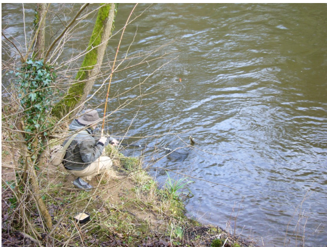
The first fish of the day

The day started quite well with the weather cold but not uncomfortable and this was when most fish were caught. After a warming cuppa in the Lodge at lunchtime the activities resumed, but as the afternoon went on the temperature started to drop and the fish went off the feed. At about 4.00 pm we retired to the warmth of the Boat Inn at Cromford for a drink, a natter and a delicious Haggis pie, chips and peas buffet.