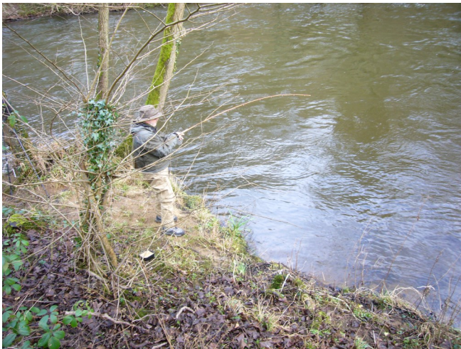
Yes I am in!!!!

February started with our rearranged fishing day on the Derwent at Cromford before the "Beast from the East" came our way. Because of one reason or another only 6 rods met at the Boat Inn for our morning cuppa before setting off to the river.