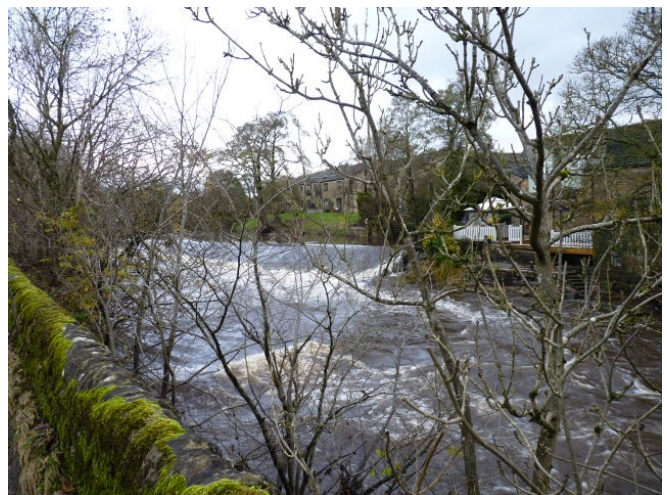
River Derwent Baslow Cont: