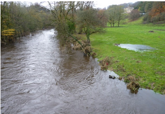
River Derwent Willersley Castle