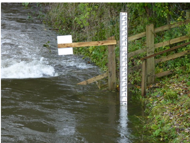
River Wye Ashford in the Water the gauge showing almost 1 Metre

As can be seen from the photographs river conditions were well out of condition and in flood. On the day the photographs were taken the river level at Baslow was about 2 metres, but a few days earlier the river level was just above 5 metres. As wading would have been allowed on some of the beats even a substantial drop in river levels would have made wading dangerous. At the time of writing (Saturday 16th October) the river level at Chatsworth monitoring station was 1.9 metres, still way above safe fishing levels. May be if the rain stops for a week or so fishing may be possible.