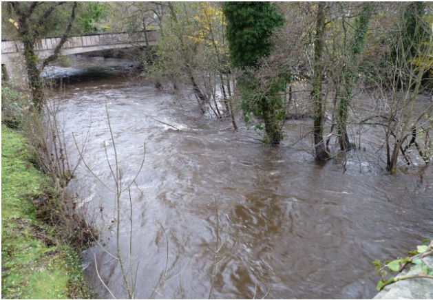
River Derwent Calver