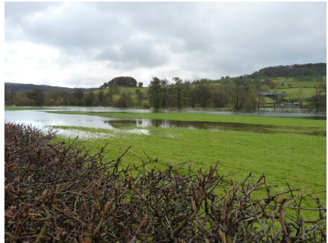
River Wye Rowsley