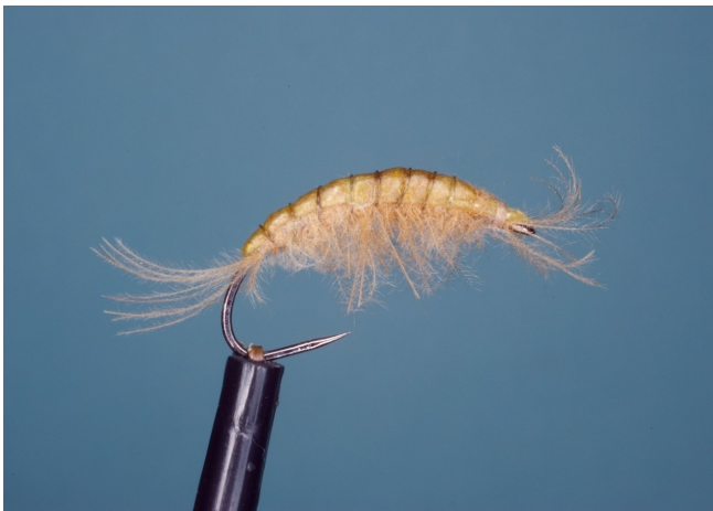
CDC Living Shrimp Cont;

All entries must reach me, Brian Clarke, 21 Corve Way, Chesterfield, S40 4YA by Friday 1st January 2021 to be considered. All entries must be accompanied by the full name and contact details of the entrant.