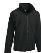
Innerjacket in Softshell.

Outershell 100% polyester A.B.T. • Lining 100% nylon/mesh. • Padding Softshell 96% Polyester 4% Spandex