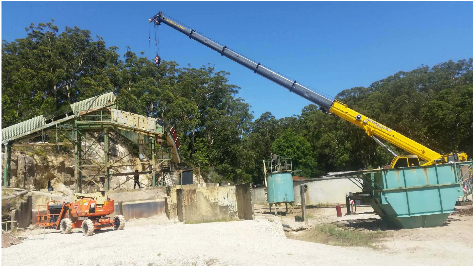
Figure 4 – Trommel, hoppers and cyclones removed, preparing to remove conveyor assembly, shaker deck and screen