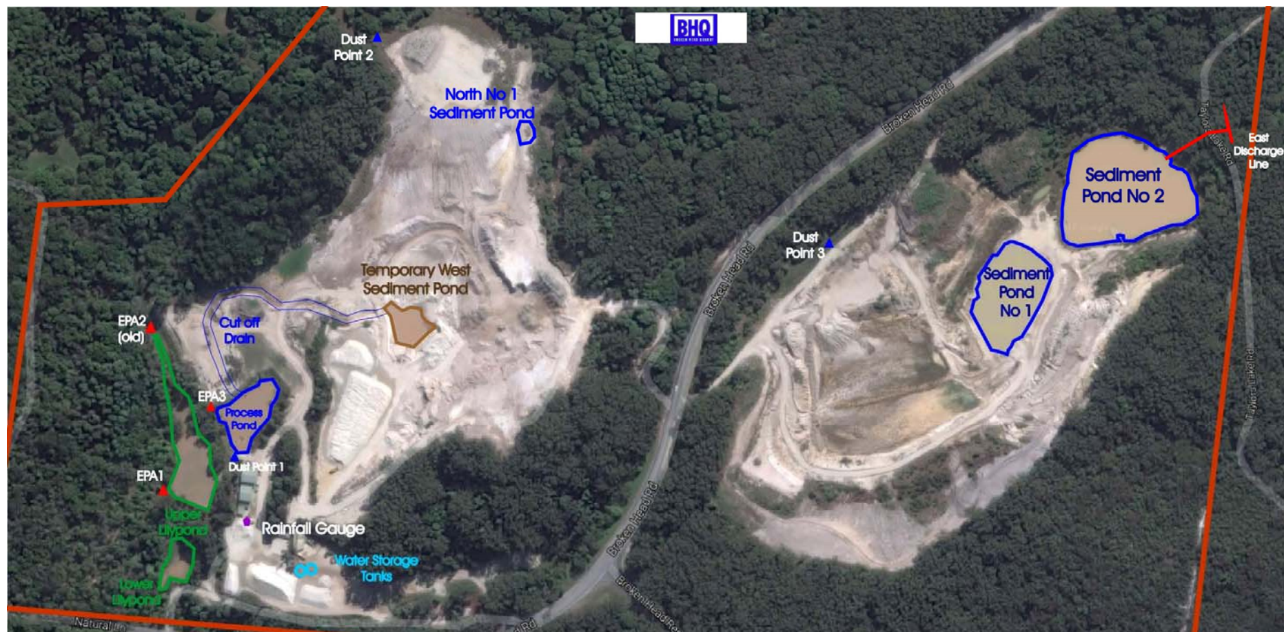
Figure 10 – Plan of major features of Broken Head Quarry

The following plan identifies key areas at Broken Head Quarry and names used to define those areas in this and other Report.