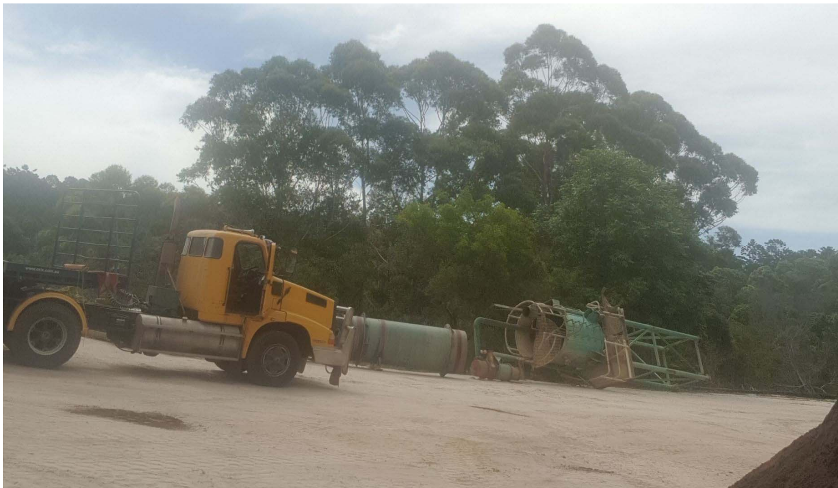
Figure 2 – Cyclones and trommel removed, awaiting loading onto flatbed semi-trailer

The following photos show the removal in progress and completed.