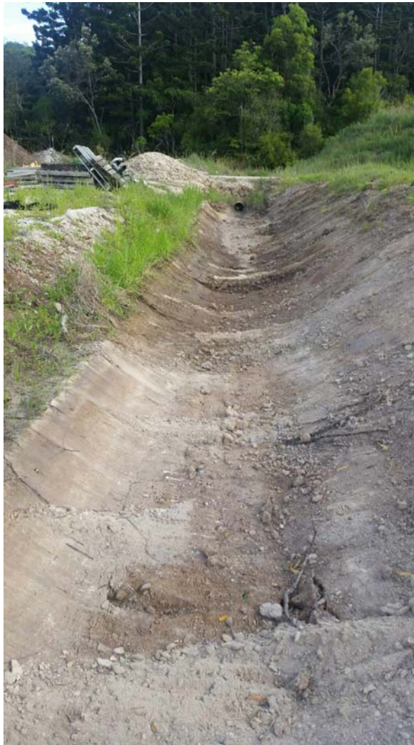
Figure 1 – Cleared cut off drain from close to entry point to Process Pond, looking northwest