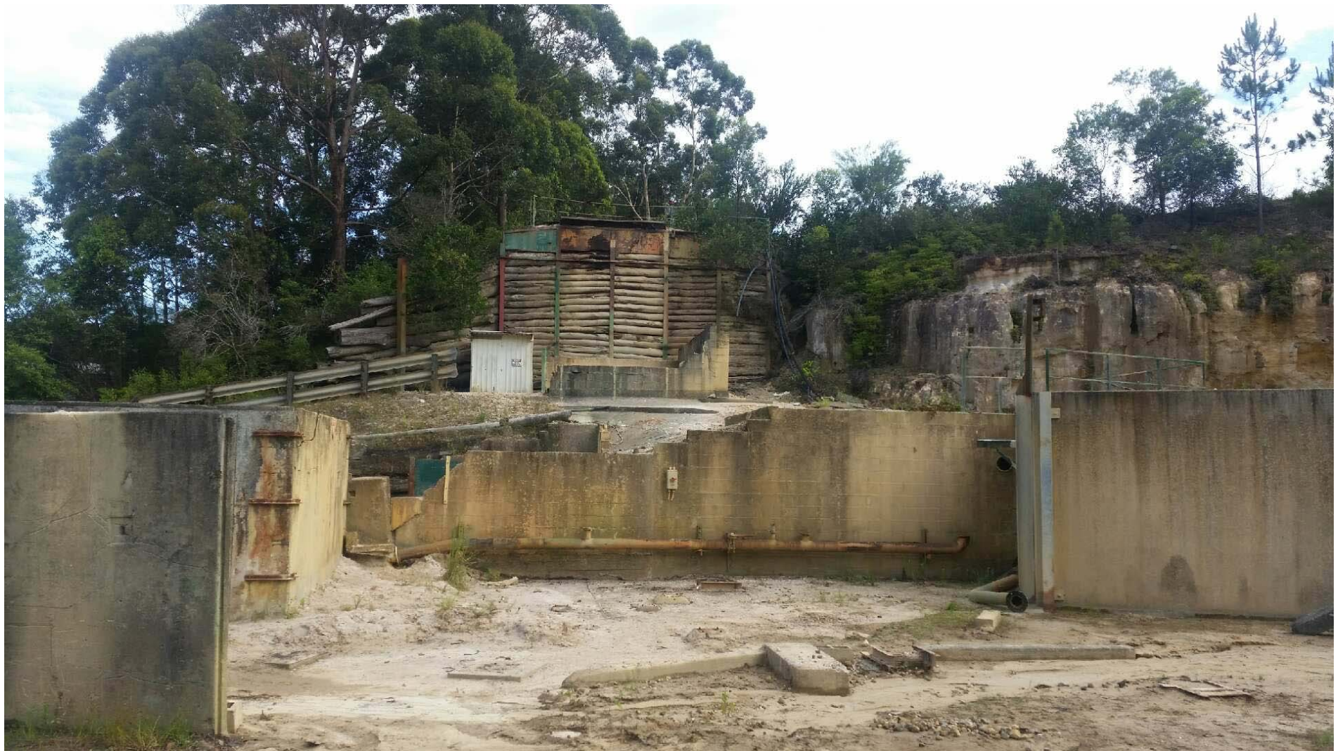
Figure 9 – All washplant equipment removed at end of job, looking north towards drop point