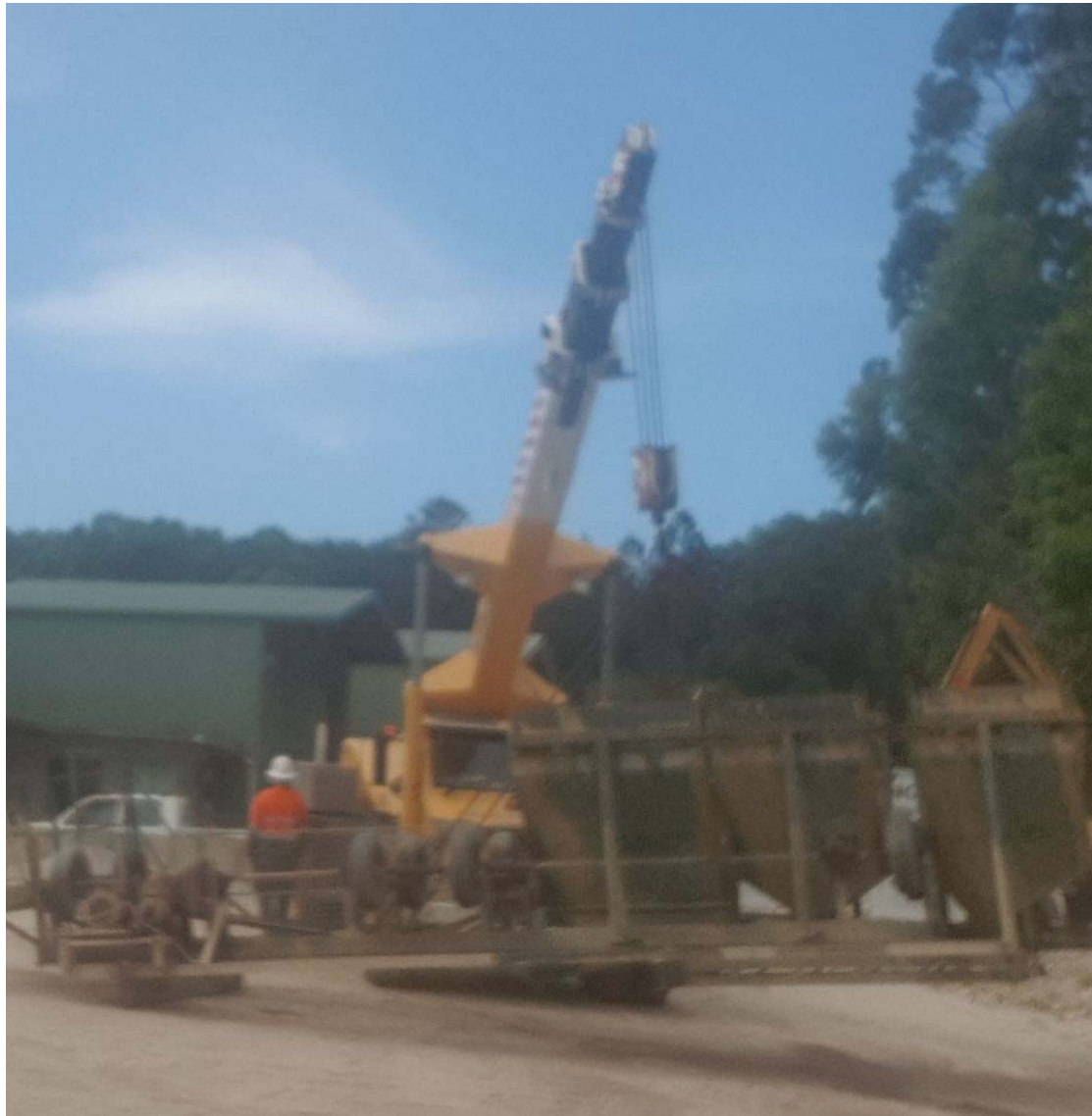
Figure 3 – Trommel screen sorting hoppers removal