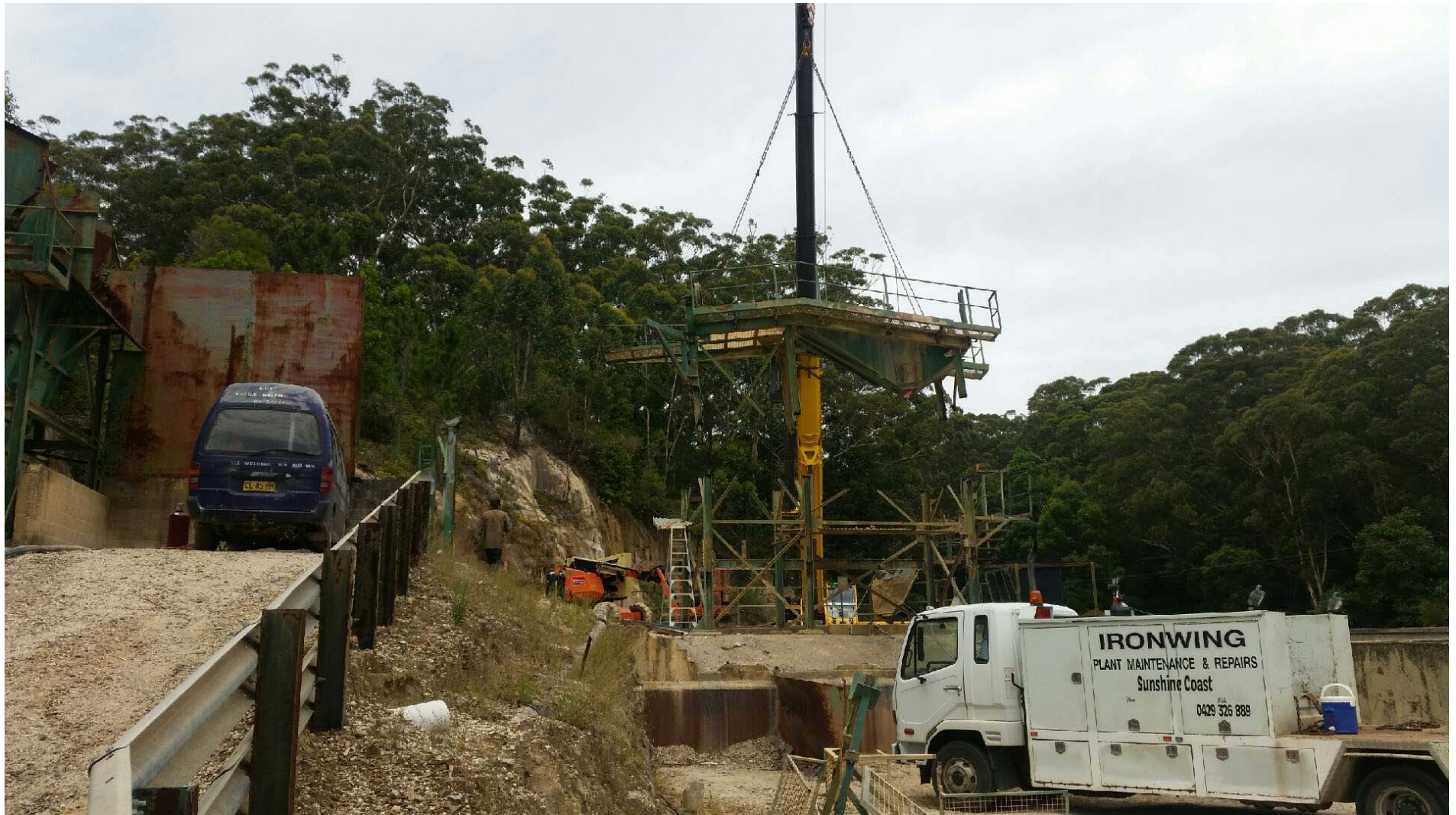
Figure 8 – Screen and catwalk removal