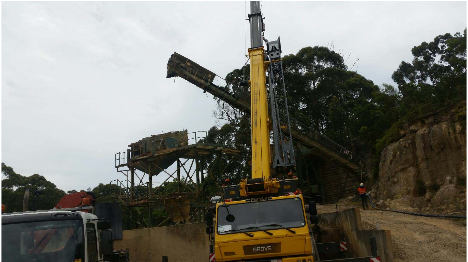
Figure 6 – Conveyor assembly removal