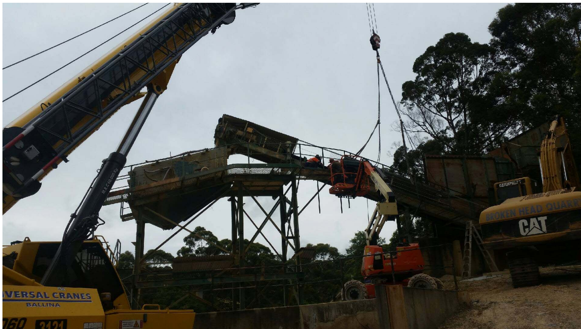
Figure 5 – Preparing to remove conveyor assembly