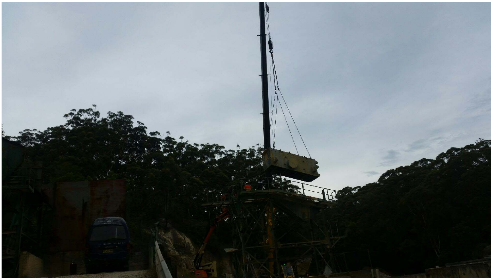
Figure 7 – Shaker deck removal