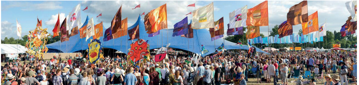
Family friendly, wonderful WOMAD

Unbelievably, it's fifty years since the Summer of Love . For those young enough to remember, that's when American tennis great Billie Jean King beat Britain's Ann Jones at Wimbledon, the Beatles released their groundbreaking Sergeant Pepper album, and 100,000 long haired, flower strewn, hippy-hued youth converged on San Francisco's Haight-Ashbury district for a memorable season of peace, love and music.