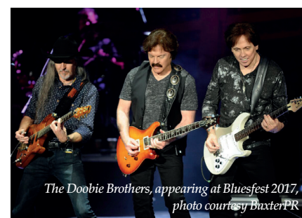
The Doobie Brothers, appearing at Bluesfest 2017, photo courtesy BaxterPR