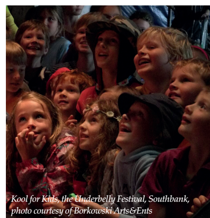
Kool for Kids, the Underbelly Festival, Southbank, photo courtesy of Borkowski Arts&Ents