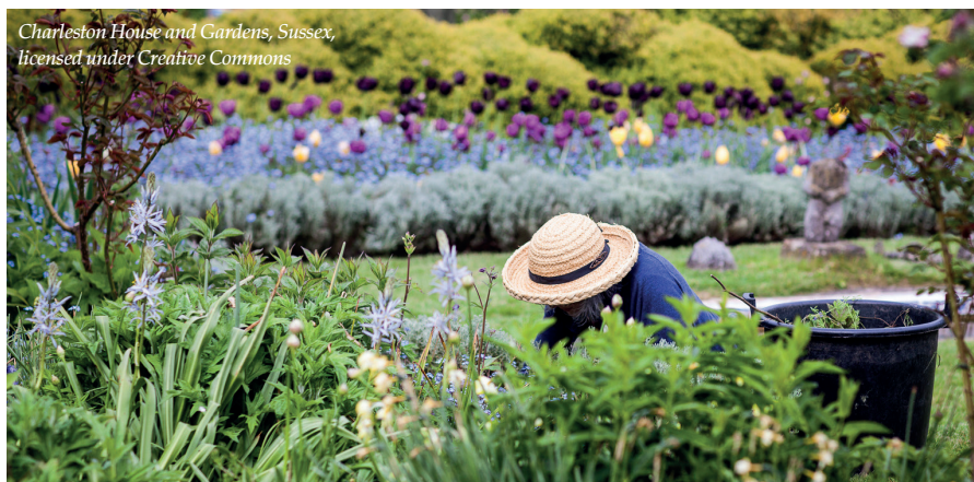
Charleston House and Gardens, Sussex, licensed under Creative Commons