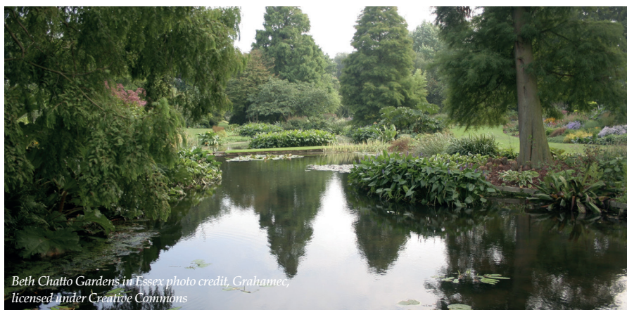
Beth Chatto Gardens in Essex

and ads for inventive garden paraphernalia.