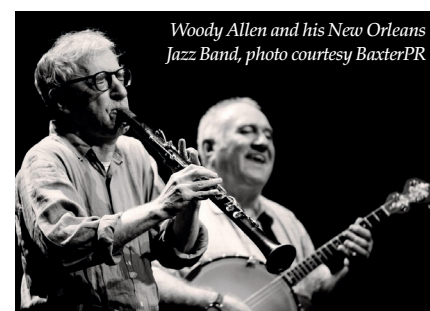
Woody Allen and his New Orleans Jazz Band, photo courtesy BaxterPR

As ever, this year's BBC Proms (14 July - 9 September) are rich with jazz sounds. Prom 27 pays a delectable double tribute to Ella and Dizzy's 100th birthdays; the music of jazz giant Charles Mingus is honoured at Prom 53 by the rocking Metropole Orkest and its dynamic young conductor Jules Buckley , and Prom 57's Swing No End matinée promises blues, boogie-woogie, bebop and a slice of musical action from the