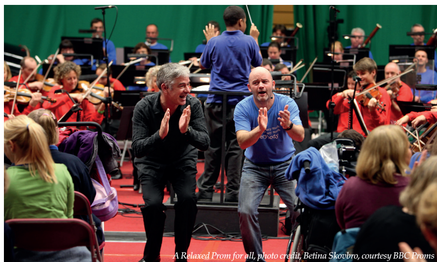
A Relaxed Prom for all

beneath Waterloo Station, you'll find more kicks for kids as Les Petits Theatre Company stages an extraordinary, immersive Alice in Wonderland . Set in multiple, magical rooms, this version of the beloved classic tale is an award-winning, push-the-boundaries theatre experience for 5-10 year olds, who will follow the White Rabbit down the rabbit hole, choose between 'eat me' and 'drink me', tumble with the Tweedle Twins and take tea at the biggest unbirthday party with the maddest of Hatters. But do heed the Company's warning: Don't be late! Logic will fail you! Nonsense will overwhelm you!