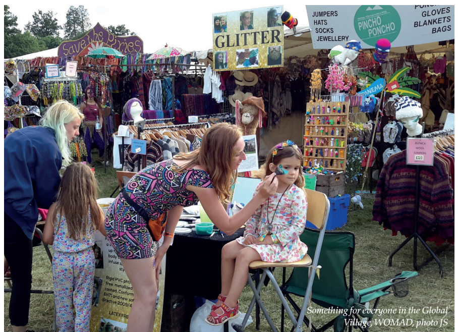
Something for everyone in the Global Village WOMAD

Taste the World serves up a popular combo of food, music and conversation under one intimate tent, as WOMAD artists take time out to cook, chat and share a favourite dish from their homeland. Breathe deeply in the cool shade of the Arboretum , sip tea and munch homemade cake in the shade of the giant turkey oaks and discover myriad ways to bathe body, mind and soul in the World of Well Being . This is your