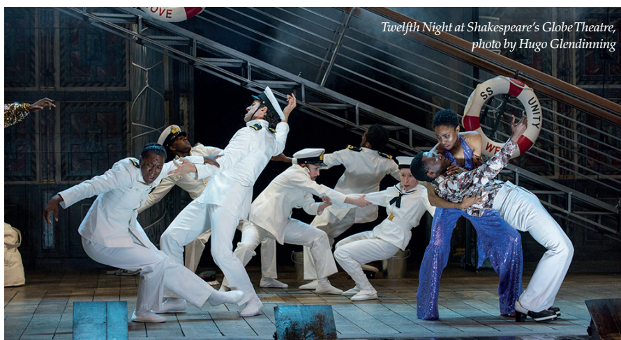
Twelfth Night at Shakespeare's Globe Theatre

The Globe, on London's Southbank, is a faithful-to-the-fingertips re-construction of the Elizabethan playhouse which once stood nearby, where Shakespeare worked and where many of his greatest plays were performed for the very first time. The original Globe enjoyed huge success, until one fateful evening in 1613 when a stage cannon misfired into the theatre's thatched roof mid-performance. It took less than an hour for the glorious Globe to be reduced to a pile of smouldering straw and ash.