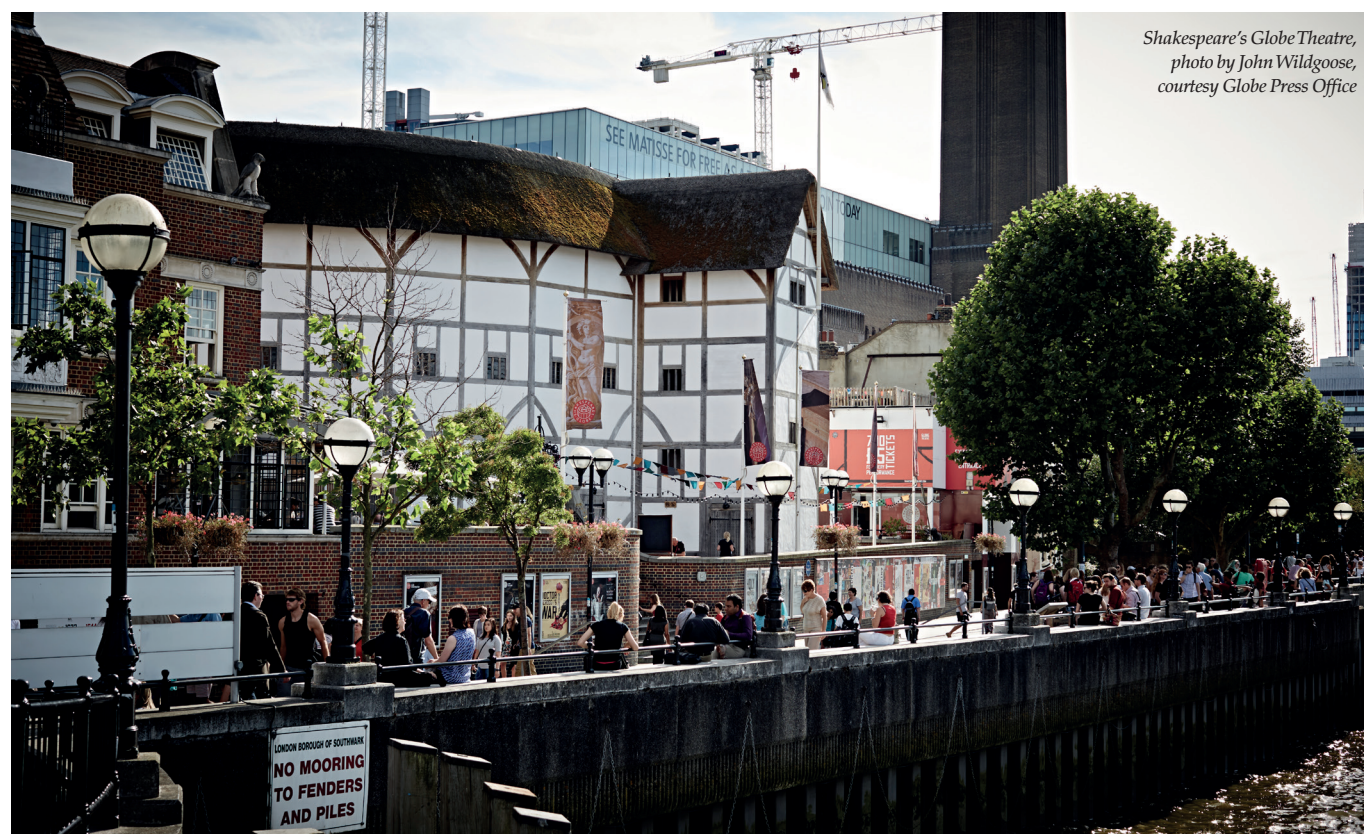
Shakespeare's Globe Theatre