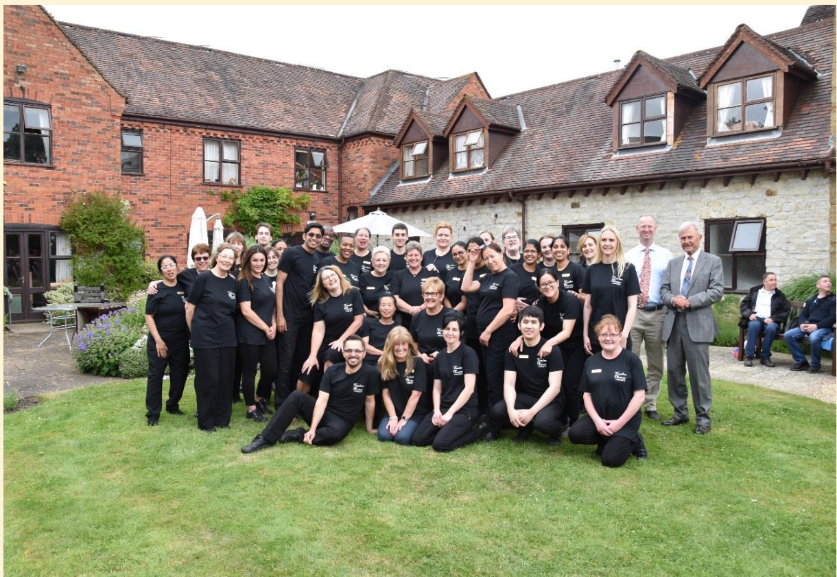
The Kineton Manor Team