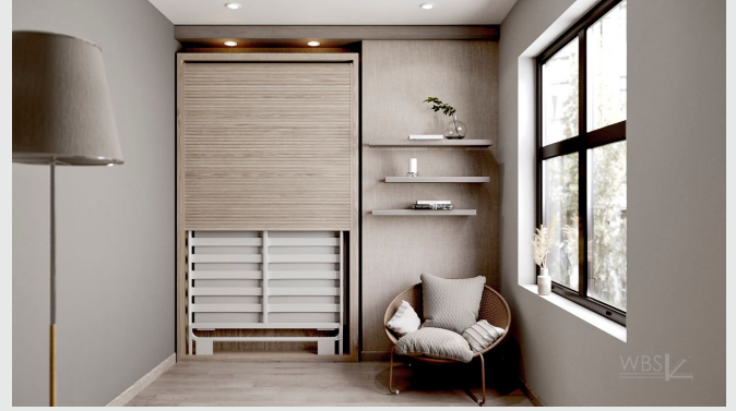
Wood or plissé shutter system