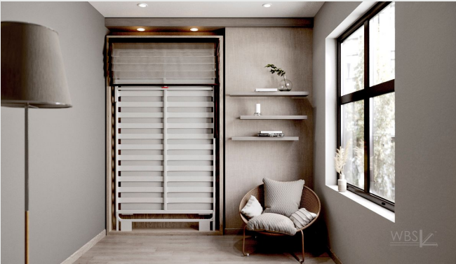
Linen hopsack made to measure roman blind system