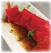
Tuna Sashimi with Fresh Garlic Ponzu Sauce*