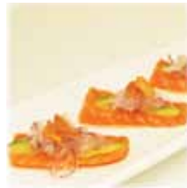
Smoked Salmon Sashimi with Crispy Garlic, Avocado, Onion & Ponzu Sauce*