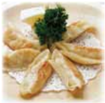
Fried Gyoza 6pc