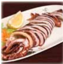
Ika Yaki grilled and lightly salted