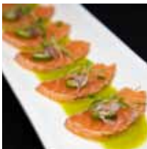
Salmon Tataki* micro cilantro, serrano pepper, sea salt w/ jalapeno dressing