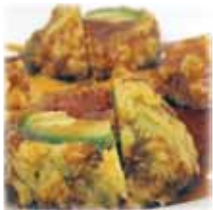
Monkey Brain* deep fried avocado stuffed with spicy tuna