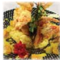
Crispy Soft Shell Crab (2 crab) w/ yam, green onion & soy mustard