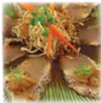
Seared Albacore w/ Crispy Onion and Ponzu sauce*