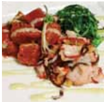
Charlie's Angels* tuna poke, octopus salad, seaweed salad