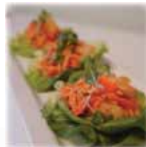
Chili Crab Lettuce Wrap spicy crab, tempura shrimp on boston butter lettuce