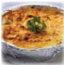
Scallop Dynamite scallop and mushroom baked in dynamite sauce with cheese on top