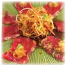
Pepper Seared Tuna w/ Crispy Onion & Ponzu Sauce*