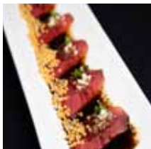
Feta Tuna Sashimi* 6pcs of big eye tuna seared w/ garlic olive, parsley, topped with feta cheese, green onion