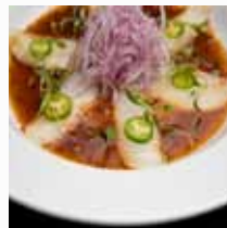
Hirame Sashimi* halibut, micro cilantro, jalapenos w/ chef's special sauce