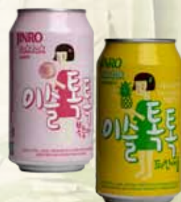
Toktok (Sparkling Soju) 4.50

Enjoy Jinro TokTok Peach/Pineapple that will make you feel awesome. With a mouthful of sparkling carbonated flavor and a low alcoholic content of 3%, Jinro TokTok can be enjoyed by everyone at anytime