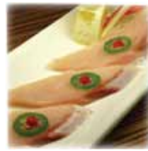
Yellowtail Sashimi w/ Jalapenos and Ponzu Sauce*