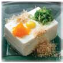
Soft Cold Tofu with House Ponzu Sauce