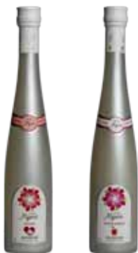
Yuki (Lychee, White Peach) 375ml 16.95

Refreshingly sweet with mellow body and smooth texture