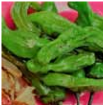
Grilled Shishito Peppers