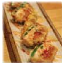
Jalapeno Poppers* deep fried jalapeno stuffed with spicy tuna and cream cheese