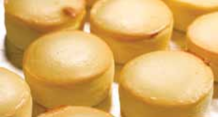
Mini New York Cheesecake