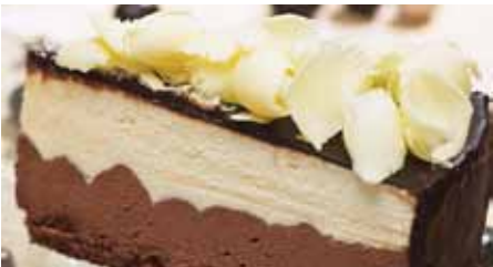
3 Chocolate Mousse

Mango, passion fruit and raspberry sorbetto, all covered in white chocolate and drizzled with chocolate