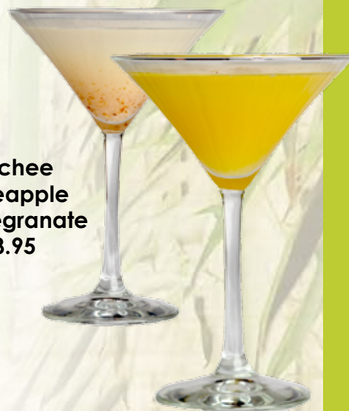
Lychee Pineapple Pomegranate 8.95