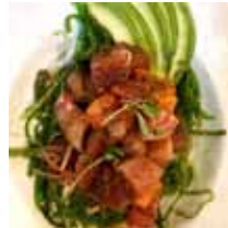
Tuna & Salmon Poke* tuna, salmon, avocado, red onion, micro cilantro w/ spicy ponzu, sesame oil