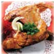
Broiled Yellowtail Collar