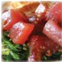
Tuna Poke* ponzu, sesame oil, sea salt