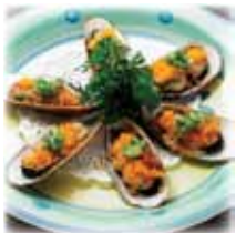
Baked Mussels w/ Dynamite Sauce 6pc