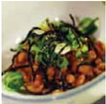
Ika & Natto squid w/ fermented soy beans