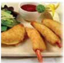
Creamy Shrimp w/ Wasabi Sauce w/ Salad