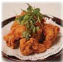
Chicken Karaage deep fried chicken breast w/ special Japanese seasoning