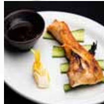
Broiled Salmon Collar