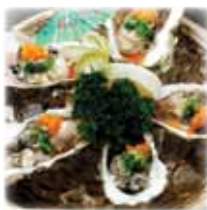
Fresh Half Shell Oysters* 5pc