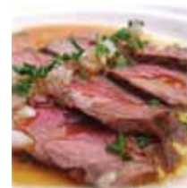
Beef Tataki* slightly seared beef tataki served in a house special sauce