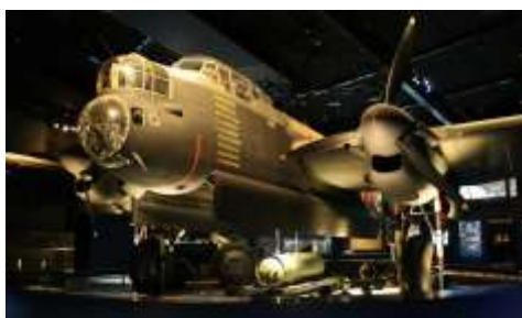
"G for George", 08 Nov 1944