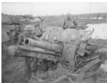
Battle of Poelcappelle, 10 Oct 1917

Japan invades Malaya and Thailand. This attack (which occurred virtually simultaneously with the attack on Pearl Harbor) would lead within three months to the loss of Malaya and Singapore.