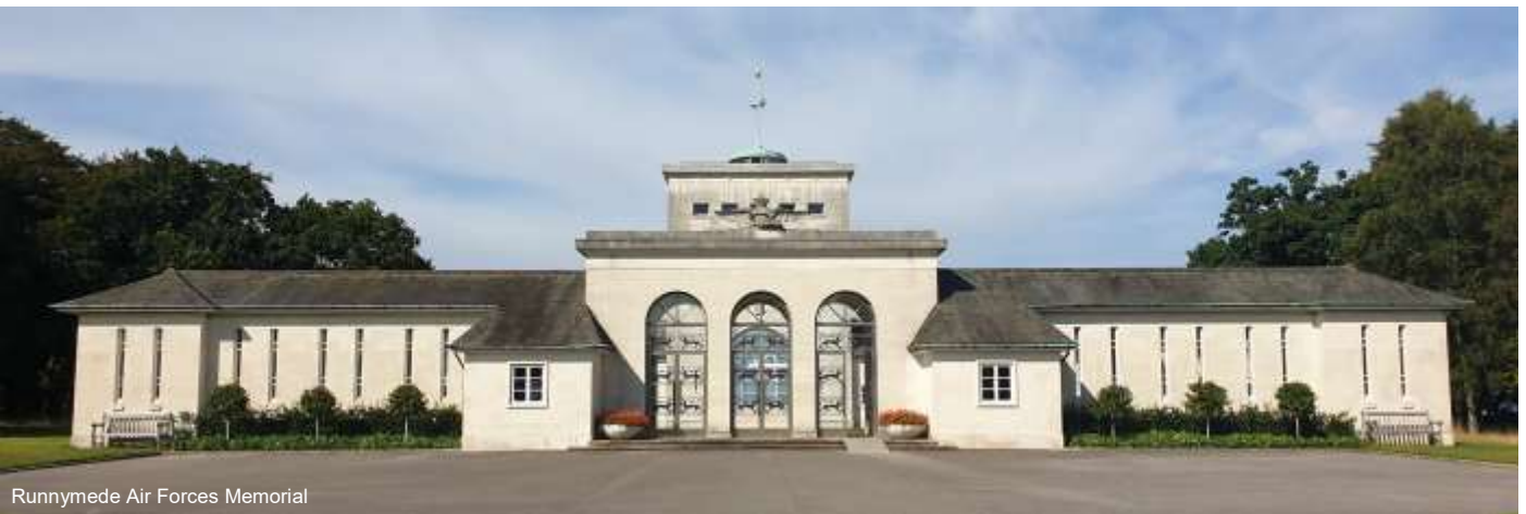
Runnymede Air Forces Memorial