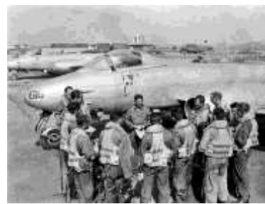
77 Squadron, 03 Dec 1954