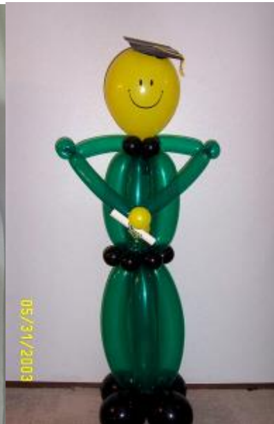
full body Standing Grad $