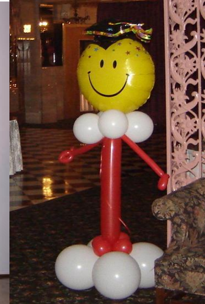
Mylar standing Grad $