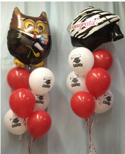
Shape 3print 3solid $