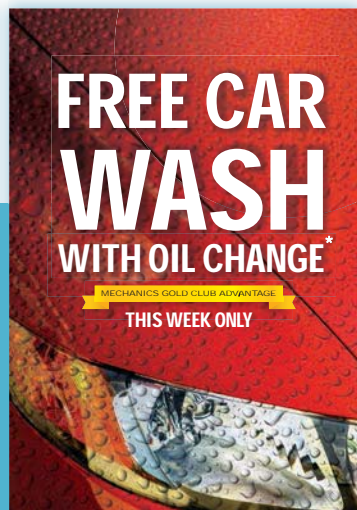
Point of sale