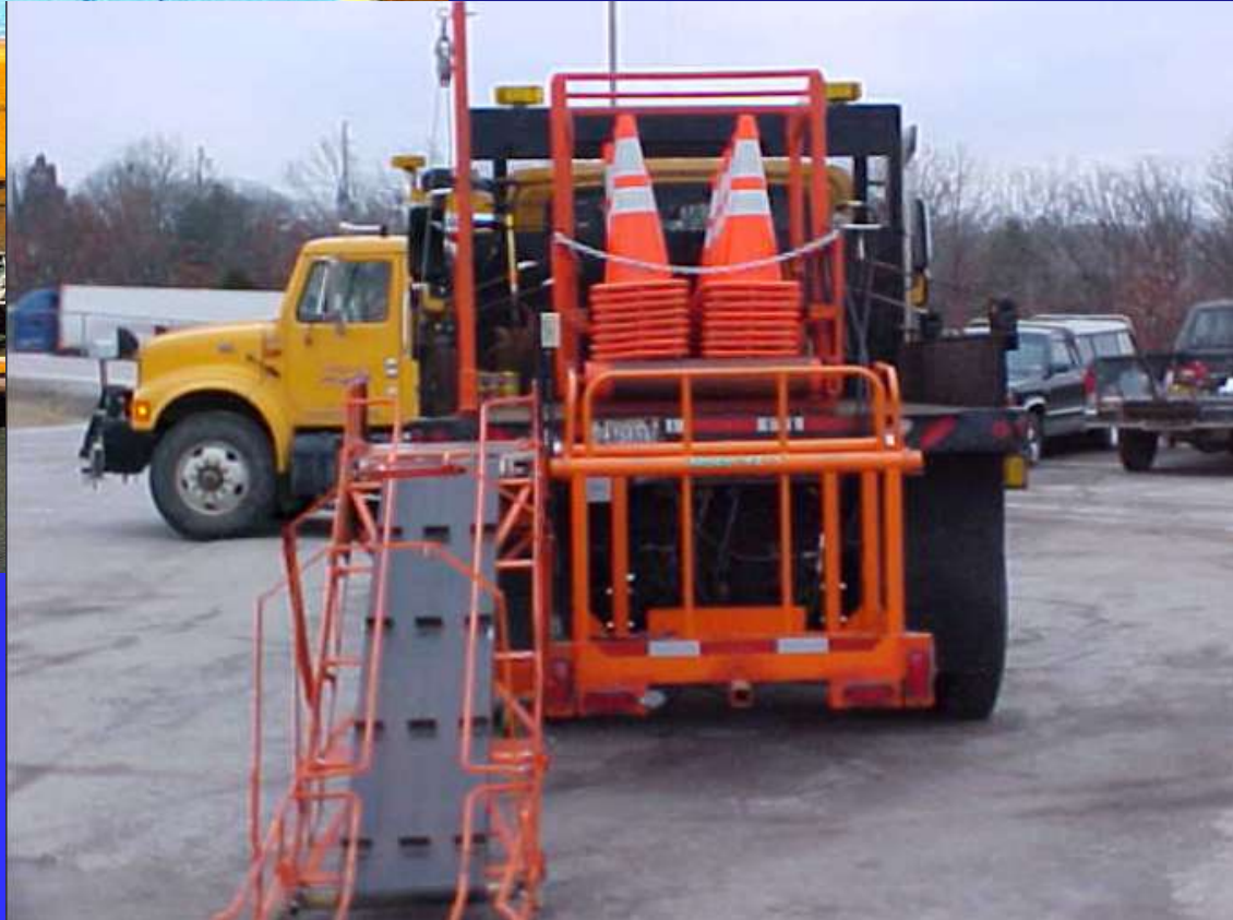
Automatic Cone Setter