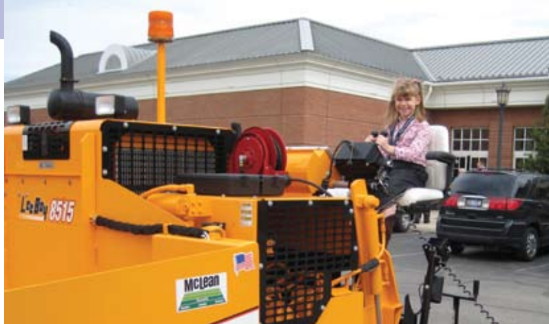
A young attendee at the FPO Annual Meeting's Equipment Expo checks out the machinery from the driver's seat.