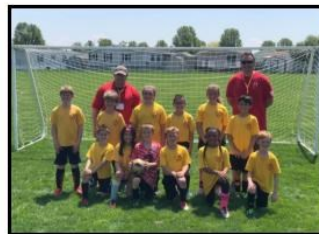
3rd Grad Soccer Team finished strong with a 5-2 Record!