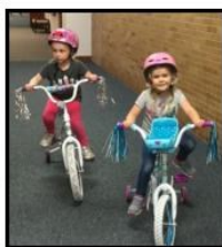
Right—Preschool Students Cruising the Halls!