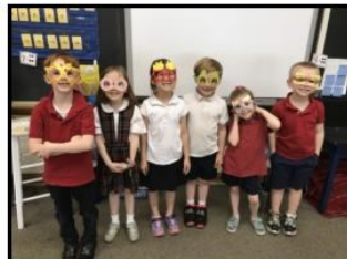
Kindergarten Shows Off their Fancy Sunglasses