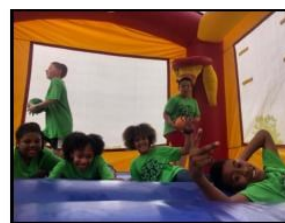
Left—Field Day 2019