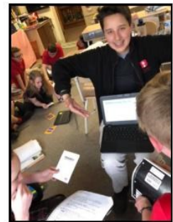
Above—8th Grade Students Incorporate Visual Literacy into History Presentations