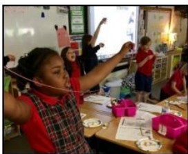
Left—2nd Grade Learns About Bubble Gum with Some Sticky Experiments