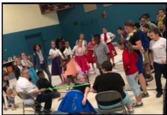
Middle School Dance to Honor 8th Grade "At the Hop"