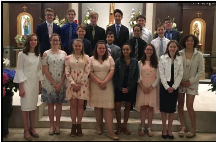
8th Grade students Participate in May Crowning