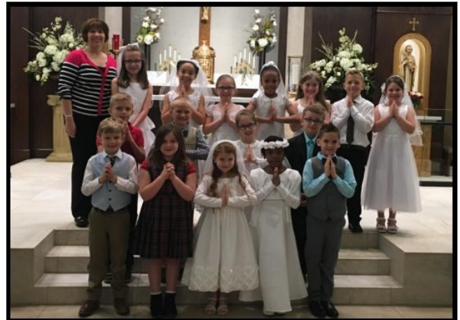
2nd Grade students who recently made their First Communion

Now Enrolling for the 2019-2020 School Year