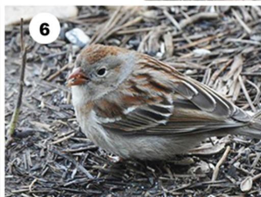
1. Harris, 2. Song, 3. White-throated, 4. Swamp, 5. Lincoln, 6. Field