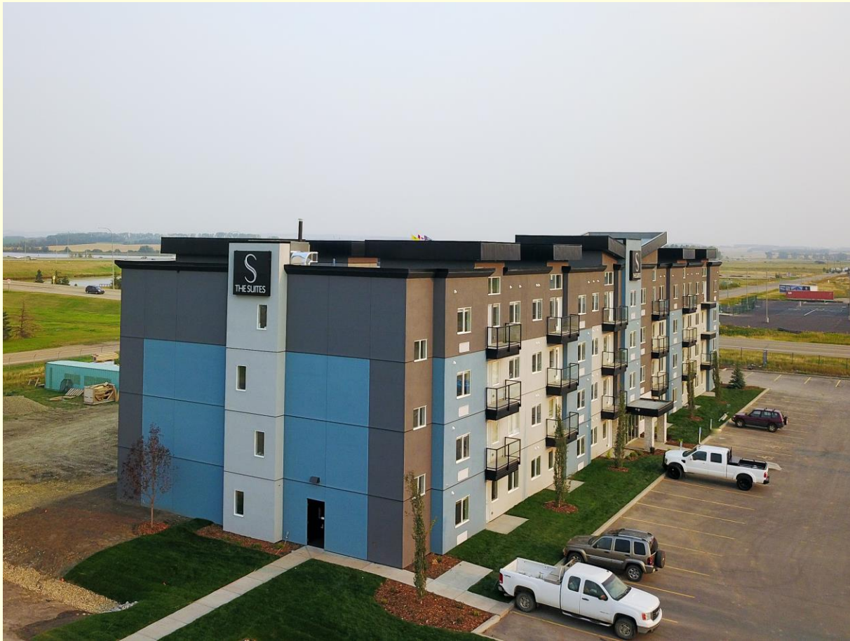
92 Suite Apartment Hotel