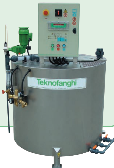
EMULSION BASED AUTOMATIC UNIT

A range of polyelectrolyte preparation and dosing units, manual and fully automatic for both powder based and emulsion based polymer.